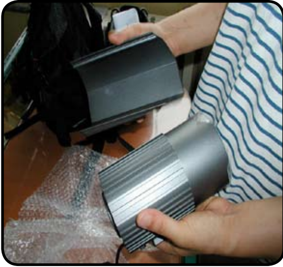
1. Remove the sunshield.