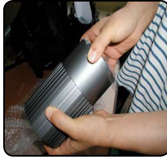
2. Turn the Front Structure counter-clockwise to remove it.